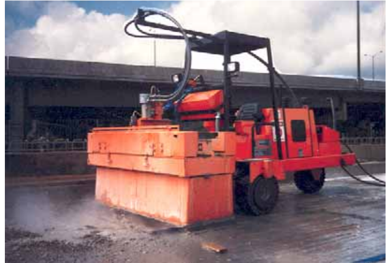
NLB Model 4400 Concrete Buster

The NLB Model 4400 Concrete Buster is a self-propelled robot-like vehicle, which is designed and built exclusively for high production concrete hydrodemolition. The vehicle is powered by a 34 hp (25 kw) diesel engine and includes a hydrostatic positive traction drive. This drive allows the unit to operate in adverse traction conditions, such as potholes, exposed rebar, and slippery inclines. The Model 4400 features an adjustable traverse movement, which allows a cut from 3 inches (76.2 mm) to 78 inches (1.98 m) wide and 1/4 inch (6.4 mm) to 4 inches (101.6 mm) deep. The control system can be manually operated or programmed for automatic operation. The overall dimensions of the vehicle are 16 feet long x 12 feet wide x 8 feet tall (4.9 m x 3.7 m x 2.4 m).