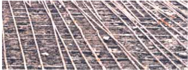
Damaged rebar grid on bridge deck after concrete removal with jackhammers.

NLB's Concrete Buster system successfully removes deteriorated concrete and asphalt via NLB's patented SPIN-JET® technology. The unique design of the high-pressure nozzle rotation is the key to high productivity and efficiency. This device moves the nozzle within the SPIN-JET carriage in a circular path at high speeds while it traverses the desired programmed width. This method seeks out deteriorated concrete, blasting away the faulty material while leaving the sound concrete with a rough texture, perfect for new bonding. Water is supplied to the Concrete Buster from a 20,000 psi (1400 bar) high-pressure pump. For maximum efficiency, NLB Model 20600D or dual 20350D pumps are recommended with pressures of up to 20,000 psi and flows to 60 gpm (227 lpm).