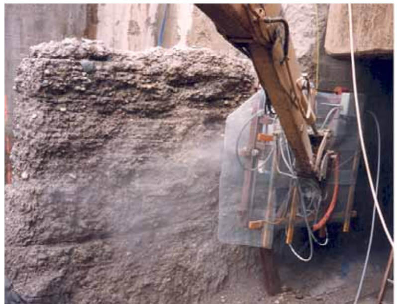
NLB Model 4000 X-Y Concrete Cutter

Hydrodemolition can also be performed on concrete substructures found under bridges, parking garages, and piers. The NLB Model 4000 SPIN-JET module is adaptable for vertical and overhead concrete removal by mounting the assembly to a variety of lifting mechanisms such as lift buckets, cranes, and back-hoes. The system can be calibrated to remove the desired amount of concrete by adjusting the speed and travel of the cutter head. The control system is semi-automated and has a cutting area of 36 inches (.9 m) wide and 43 inches (1.1 m) high. Because the Model 4000 is made from light weight aluminum, the module weighs only 400 lbs (181 kg), making the equipment less labor intensive. The overall dimensions of this system typically are 3'6" wide x 6'3" tall (1 m x 1.9 m).