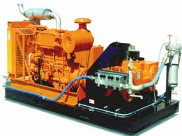
NLB Model 350 Series water jetting system

The NLB high-pressure water jetting pump is the powerhouse of the Concrete Buster system. NLB pumps feature stainless steel fluid cylinder design and are built for continuous heavy-duty operation with minimal maintenance requirements.