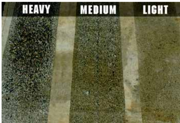
Various levels of concrete scarification

Numerous concrete surfaces are coated with materials to reduce moisture seepage and premature wear. These coatings, commonly called membranes or epoxy coatings, must periodically be removed so the concrete surface can be inspected, repaired, or recoated. The NLB SPIN-JET coating removal system delivers water at pressures of up to 20,000 psi to the surface to remove any stubborn coating.