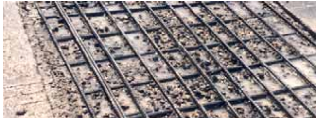
Hydrodemolition leaves rebar free of damage and clean for ideal new overlay bonding.