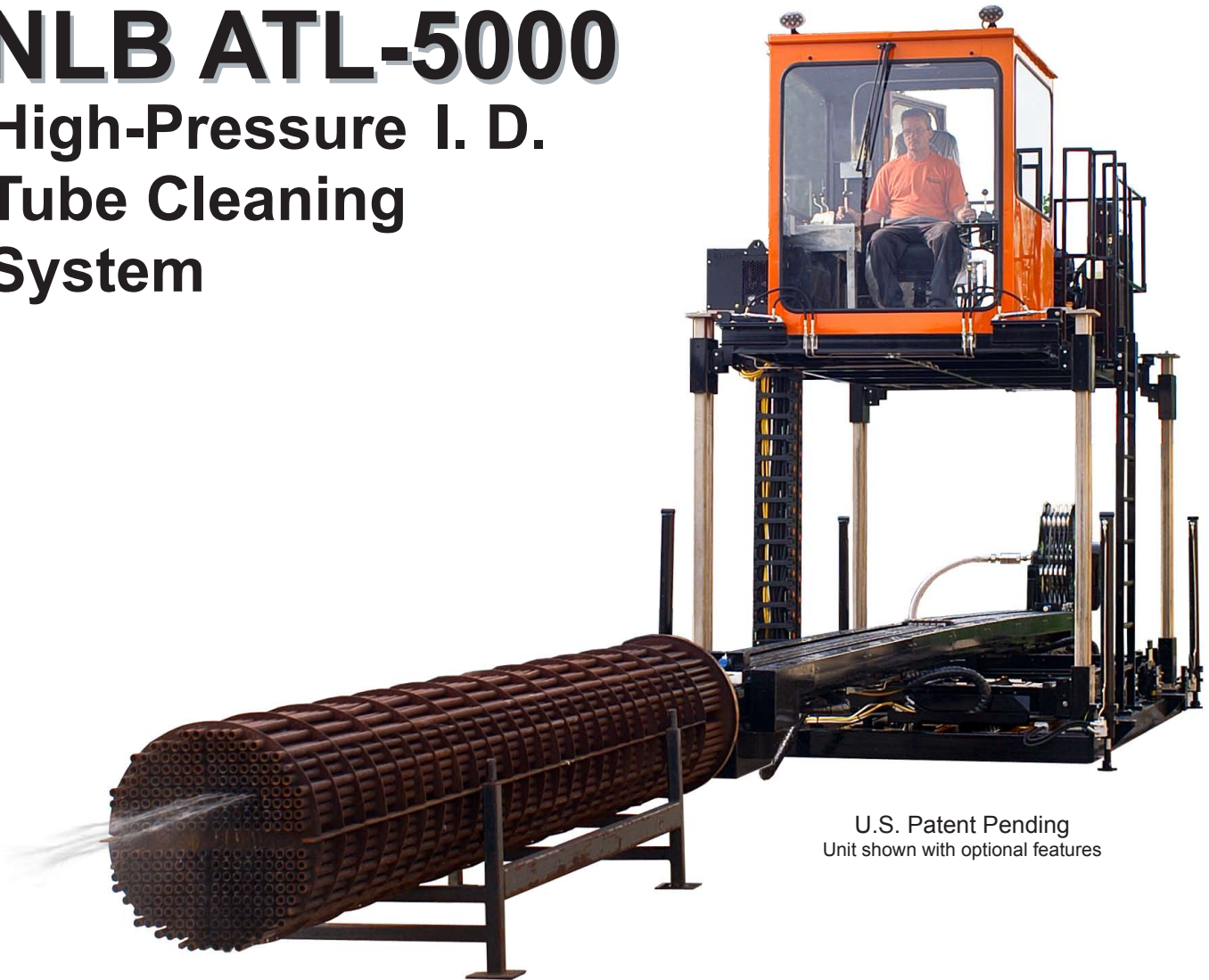
U.S. Patent Pending Unit shown with optional features

NLB's new ATL-5000 bundle cleaning system is designed to allow the I. D. of tube bundles to be cleaned by a single operator from the comforts of climate controlled operator station. From the station, the operator controls the up, down, left and right movements of the lance bed. The in and out movements of the lances, and the up and down movement of the outriggers/levelers can be also be controlled. And, with the addition of the bundle roller control package, the operator can control the rotation of the bundles.