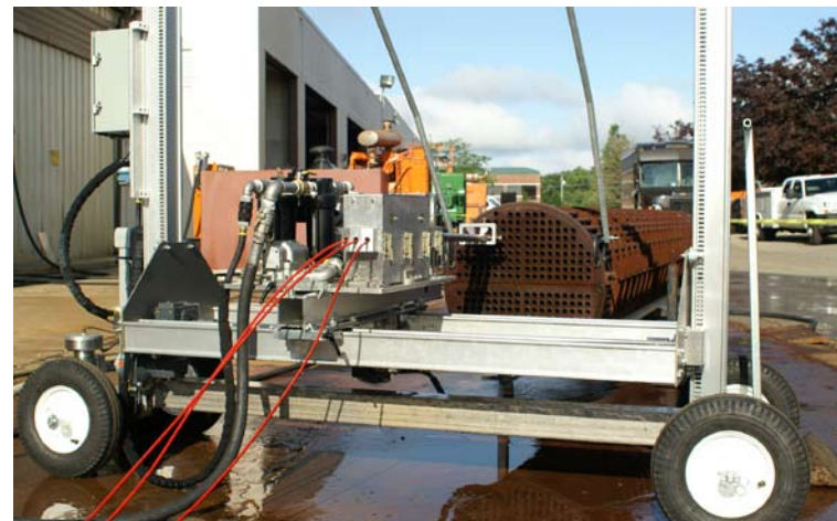
The powerful lance drive system makes changing hoses as easy as opening the enclosure, taking the old lances out, and putting the new lances in. No belts or paddles to change, and no adjustments are necessary.